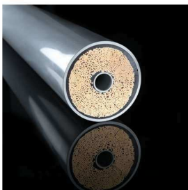
Membrane for ultrafiltration (sanitisable)

Detergent and disinfectants for the complete water treatment system and especially for ultrafiltration and reverse osmosis membranes