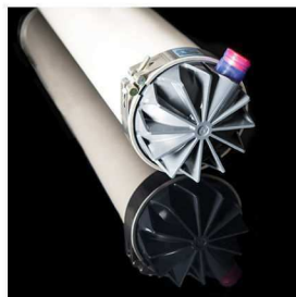
Membrane for ultrafiltration (basic)