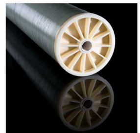
Membrane for reverse osmosis (sanitisable)