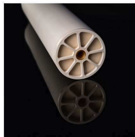
Membrane for reverse osmosis (sanitisable)